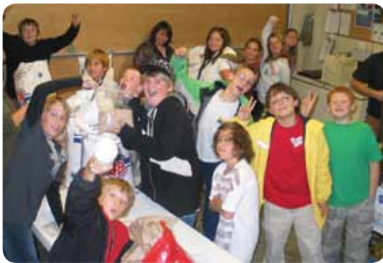
BCTAC II field trip to the Blaine County Hunger Coalition Oct. 2009