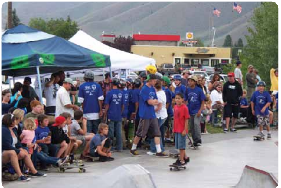
St. Luke's YAK! and the City of Hailey co-sponsored the Hailey Skate Show 2009

Opportunities exist for volunteering all winter long, on a one-time or recurring basis. Organizations YAK! supports include: Sun Valley Adaptive Sports, the Hunger Coalition, The Advocates, Souper Supper, The Environmental Resource Center (ERC), The Nature Conservancy/Silver Creek Preserve, and the Wood River Animal Shelter.