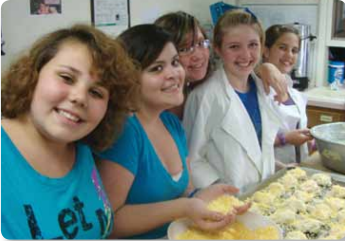
BCTAC II members cook a delicious meal for the Souper Supper at St. Charles Church.